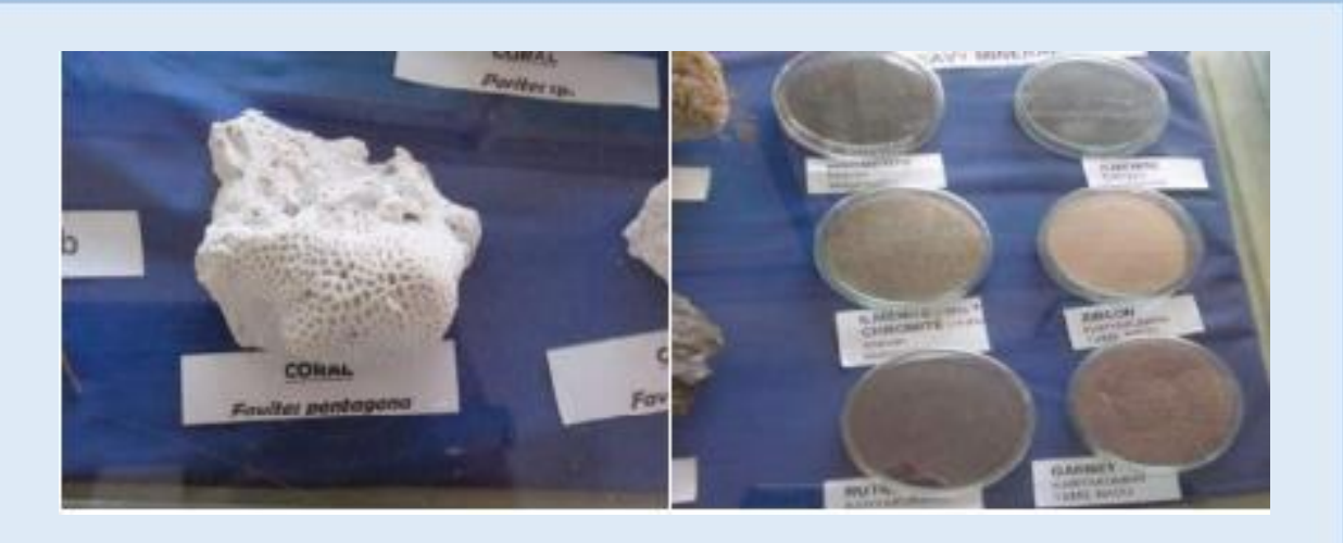
Visit to National Institute of Oceanography, Goa by Zoology Department